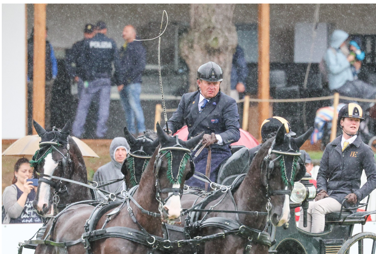
Boyd Exell (AUS)